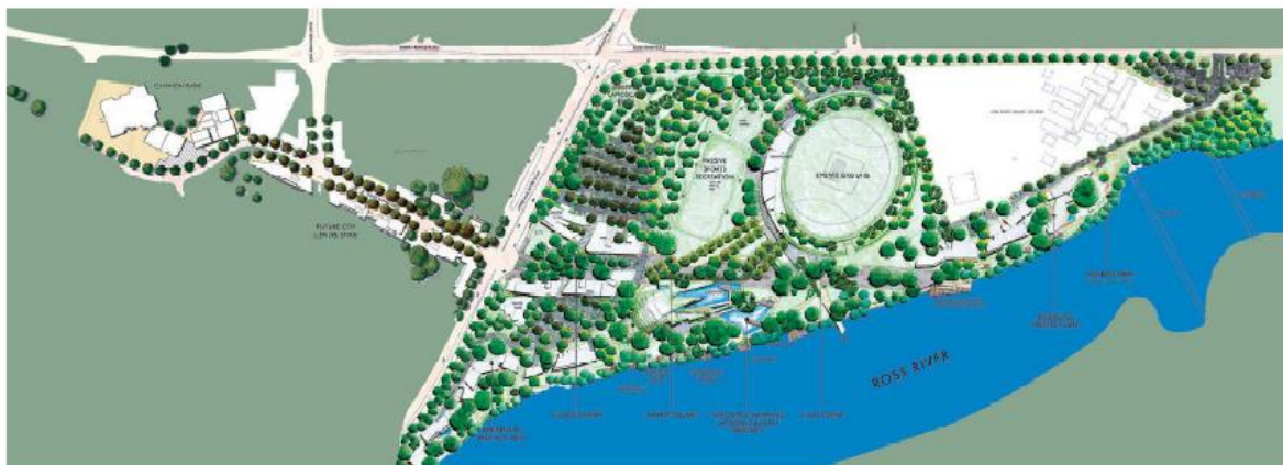
Pioneer Park Master Plan